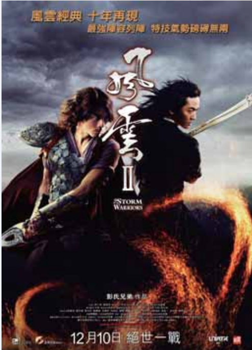
Acknowledgement 鳴謝 Universe Entertainment Limited 寰宇娛樂有限公司